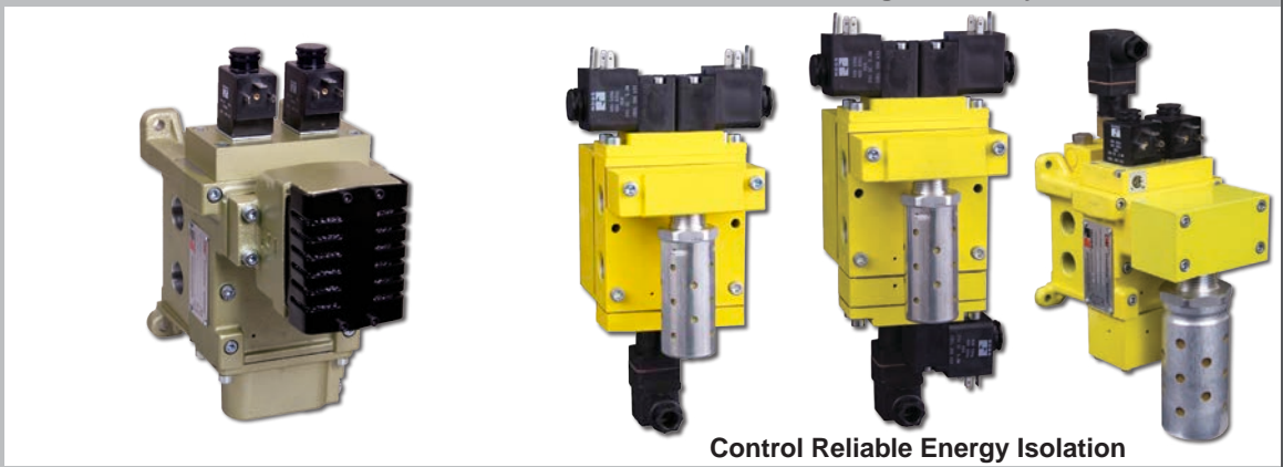
Control Reliable Energy Isolation